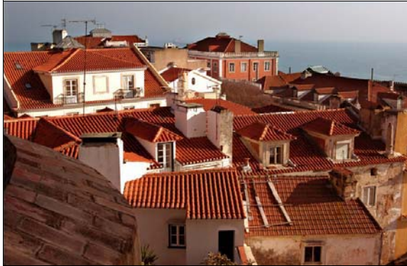
Portugal: Roofs of Alfama. Motive from the oldest part of Lisboa.