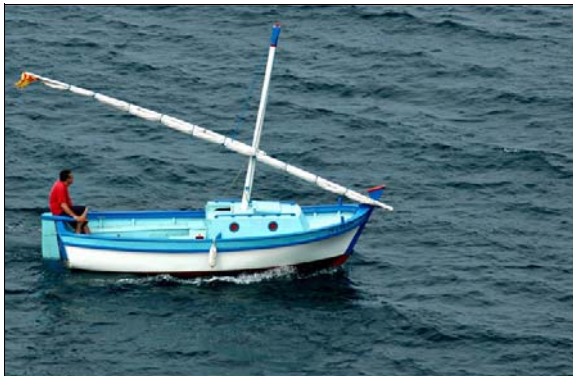
France: A man and his boat in typical Catalan style sailing outside the little town Collioure in the South