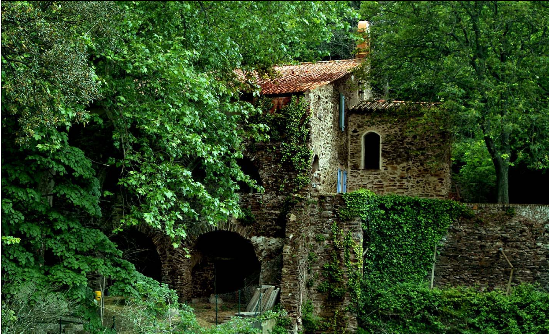
France: Deep into a small valley in the South of France, not far from the Spanish border you will find this old monastery and hermitage N.D Consulation. The old buildings almost hidden in the green plush.